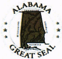
Kay Ivey Governor